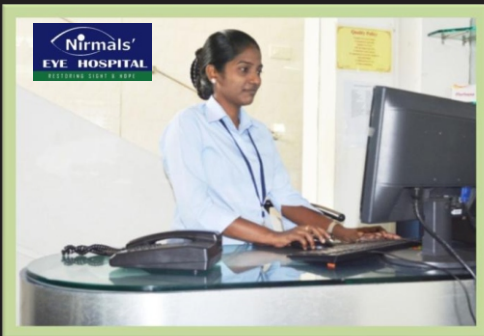
Integrated Patient Reports

I.H.O Dedicated Health Services Med Save Healthcare Sunrise Medcorp TPA Pvt Ltd T. T. K. Health care / Vidal Health