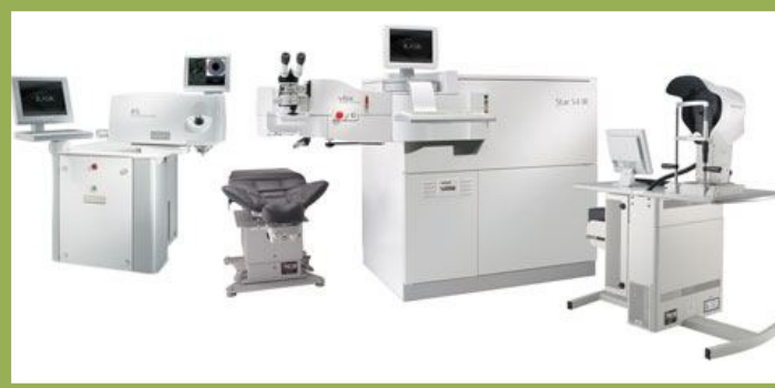
Advanced Femto Lasik

IOL MASTER, KERATOMETER: IOL-Master is to determine eye length for calculation of intraocular lens power.